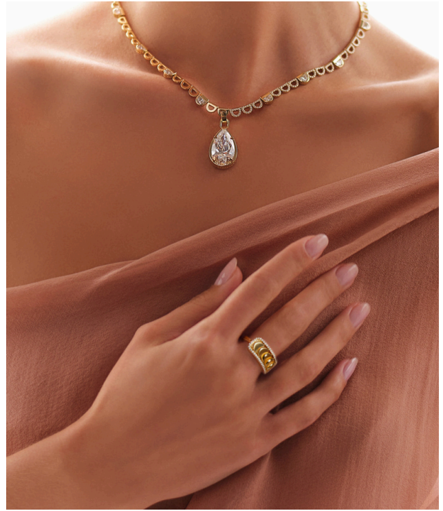
Aura Unbound Necklace with Pear Pendant Aura Diamond Ring with Reversible Diamond Pavé Crescents