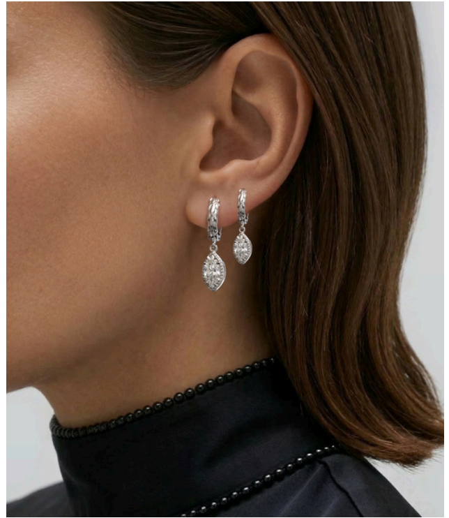
Dragon Scale Gold Hoop Dangle Earrings with Marquise Diamonds Petite Dragon Scale Gold Hoop Dangle Earrings with Marquise Diamonds