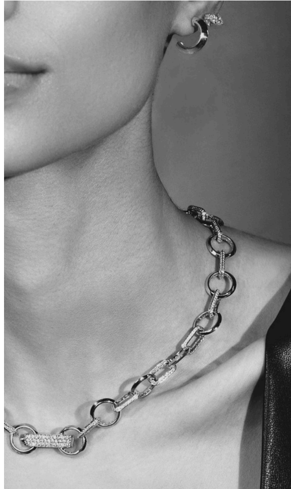
Duel Gold Chain Ring Duel Diamond Pavé Gold Chain Ring Duel Wrap Conch Jacket Earring with Diamond Pavé and Gold Hoop Studs Duel Chain Necklace with Diamond Pavé