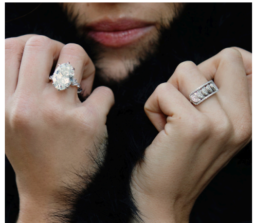
Diamond Ring with Side Diamonds and Secret Heart X Diamond Pavé Earrings