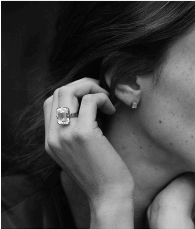
Bezel Frame Solitaire Diamond Ring with Hidden Cluster Diamond Halo