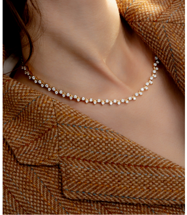
XO Diamond River Necklace