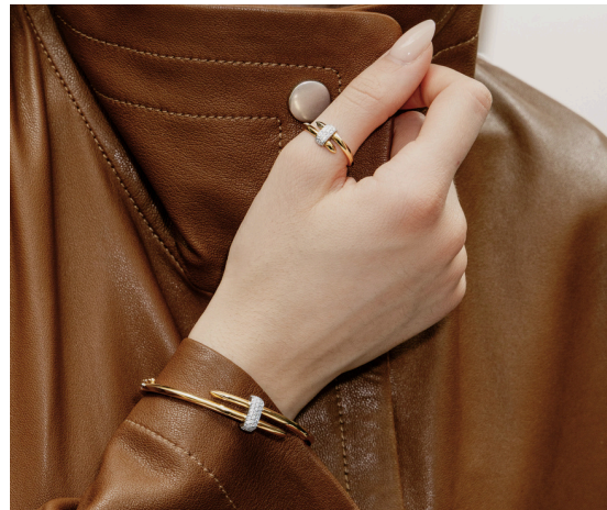
Duel Gold Wrap Bangle with Diamond Pavé Moving X Bangle with Diamond Pavé