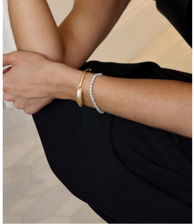
Aura Diamond Bangle with Reversible Diamond Pavé Crescents Blossom Diamond Tennis Bracelet