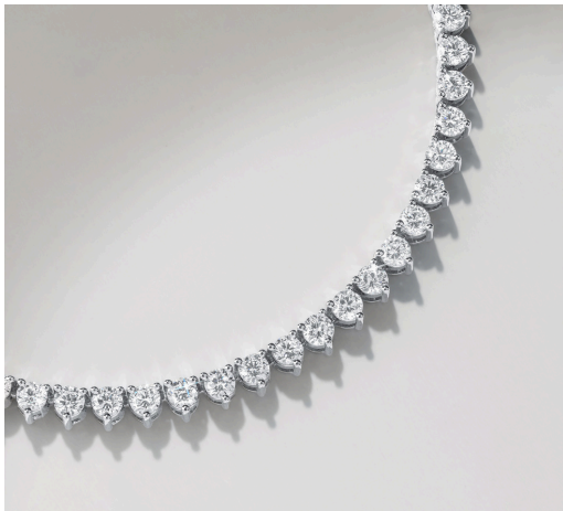
Shared-Prong Diamond Pavé Hoop Stud Jacket Earrings with Pear Diamonds Three-Prong Diamond River Necklace