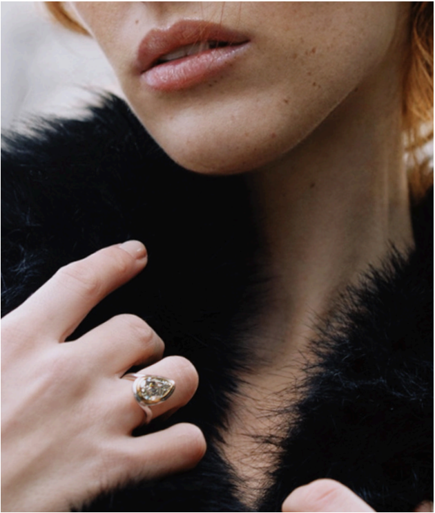
Love Knot Twist Bezel-Set Yellow Diamond Ring