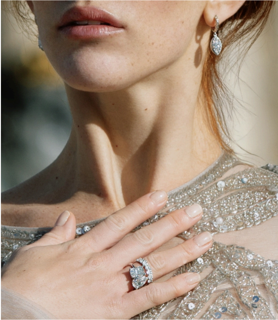
Two-Stone Elongated Cushion and Pear Diamond Ring Seven-Stone Oval-Cut Diamond Ring